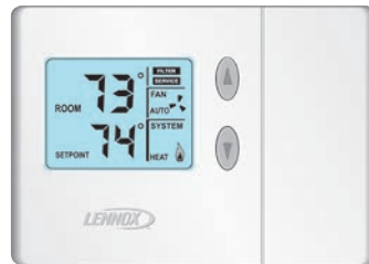
Model COSTAT12AE1L (non-programmable)