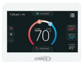
Model: COSNAJ03FF1L CO 2 Model: COSNAJ22FF1L