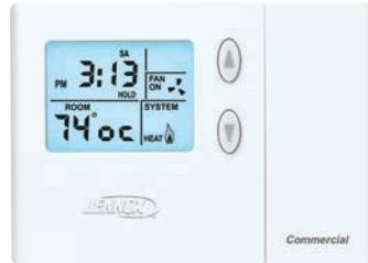
Model COSTAT05FF1L (commercial programmable)

Stylish design complements any interior setting